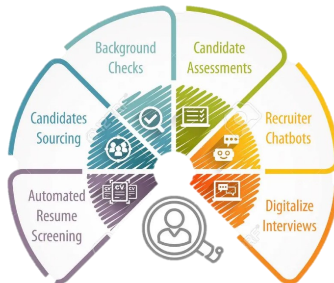
Figure 2: Impact of technology on the recruitment and selection process, figure generated with https://www.123rf.com

AI is a new concept introduced in the field of human resources. However, it can have a significant impact on people management, especially in recruiting, training, growing and retaining employees in the workplace.